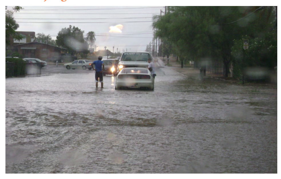
Figure 1. This photo was taken on July 28, 2008, several blocks north of Speedway Boulevard on Park Avenue in Tucson.

The Centers for Disease Control reports that more than half of all flood-related drownings occur when vehicles are driven into hazardous flood waters. The next highest percentage occurs when people on foot are swept into swollen