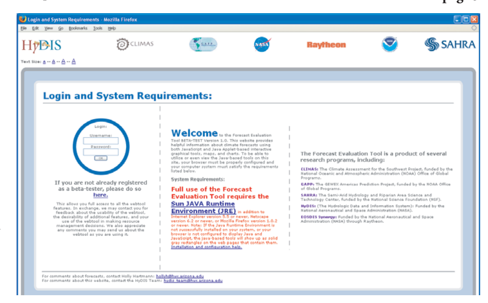
Figure 1. FET homepage (http://fet.hwr.arizona.edu/ForecastEvaluationTool).