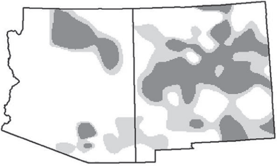
Figure 1. Winter precipitation and the PDO; darker areas indicate the strongest relationships. From Brown and Comrie (3).

A different study (4) also reveals strong correlations between the PDO and precipitation in New Mexico. As summarized in Table 1, the warm continued on page 2