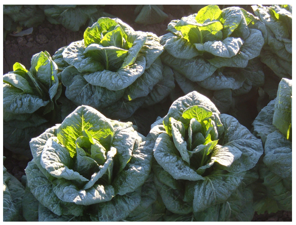
When nighttime temperatures drop below 32 degrees F, the outer lettuce leaves may freeze, making them inedible.

Other cold sweeps followed, including a late February cold front that brought a dusting of snow and hail to major metropolitan regions in Arizona and New Mexico before winds carried it northeast into the Midwest and eventually New England. These events had one thing in common: they resulted from a shift of Arctic air southward thanks to a climatic pattern called the Arctic Oscillation (AO). It's also known as the North Atlantic Oscillation and